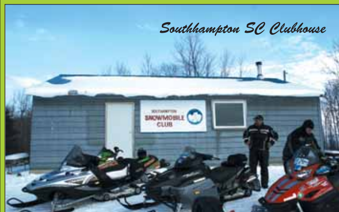
Southampton SC Clubhouse

We rode to Chesley and arrived at the Chesley Clubhouse which is about the same size as the ones we visited yesterday only painted a different colour. After heading south from Chesley, we rode on beautiful trails through farm fields and mature forests and arrived at the Saugeen Snowmobile Clubhouse. Another beauty, this Clubhouse is actually located on the Saugeen River and is another site for taking some beautiful pictures. Heading back northwest, we ran this trail for roughly 10 clicks before reaching the town of Paisley and TOP trail B108. This trail is really interesting in that it follows the Lake Huron shoreline, passing the towns of Port Elgin, Southampton and Sauble Beach along the way. There's no lack of accommodations, gas or food along this stretch of trail. Just take a peek at the Dining and Accommodations section in this issue. B108 is also the trail that heads right up to Tobermory, at the tip of the Bruce Peninsula, another trip really worth taking if you have extra time.