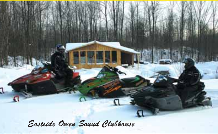
Eastside Owen Sound Clubhouse