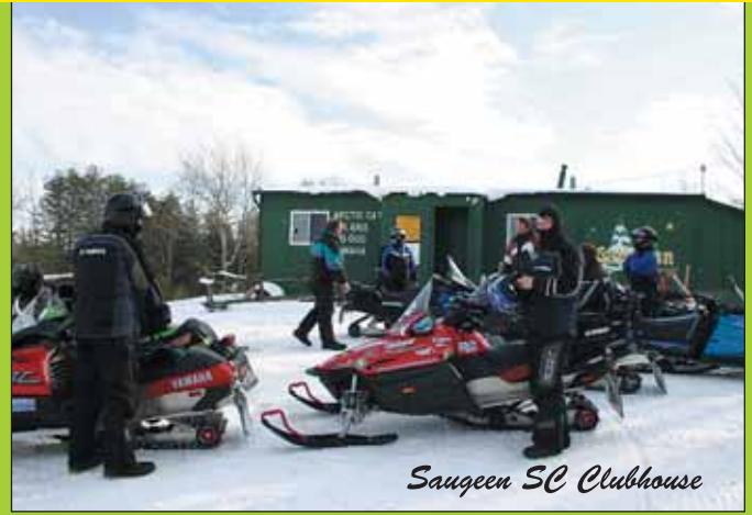
Saugeen SC Clubhouse

We continued on until we joined up with the TOP B trail, south of Meaford. Along this trail, we stopped by the Meaford Clubhouse, the second of the day. With the lowering sun, we were privy to a gorgeous sunset, one I'm told is typical to the region. Dinner took us to Ted's Range Road Diner, outside of Meaford. The food's good and the atmosphere is something I can only describe by saying: "You've just got to see it for yourself. This alone is worth the trip". After leaving Ted's, we hopped back on the B trail and headed back to the Days Inn. Considering there was only a few hours left in the day when we first left, we were really pleased as we managed to ride 120km on this loop.